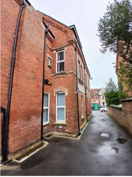
Exterior Structure (The Building)