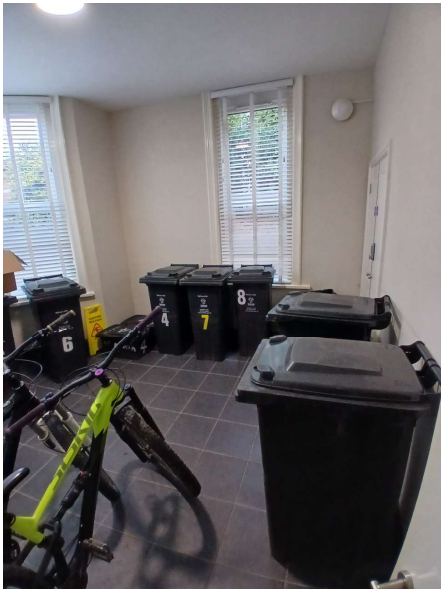
Bin Store (Waste Disposal Area)