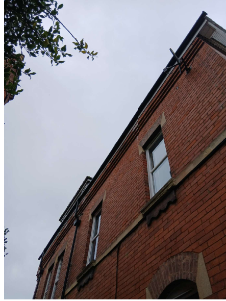
Guttering (Gutters and Fascia)