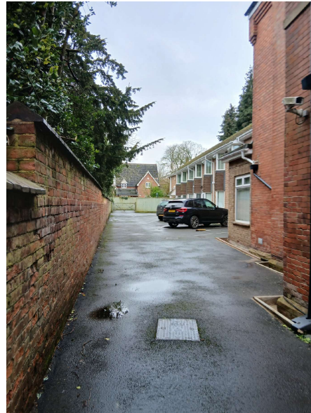
Car Park (Vehicle Parking)