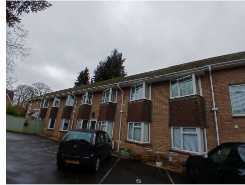
Roofing (Tiles and Cladding)