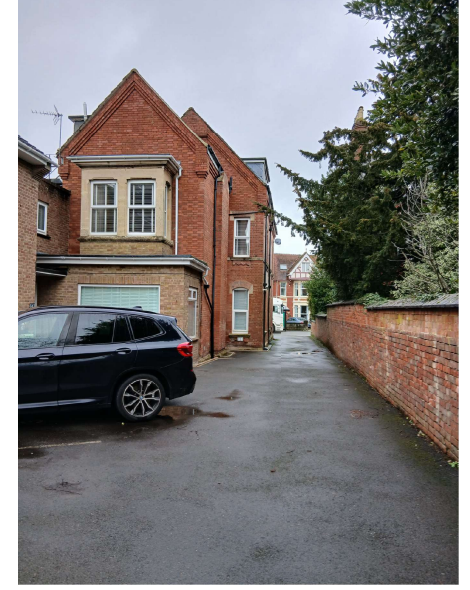
Communal Grounds (Gardens and Common Areas)